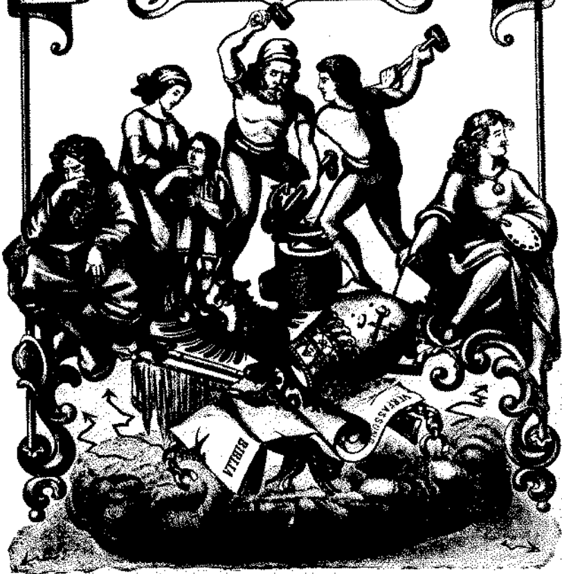
The title-page of Volks-Kalender , Brunswick, 1878

Braunschweig. Druck und Verlag von W. Bracke jr.