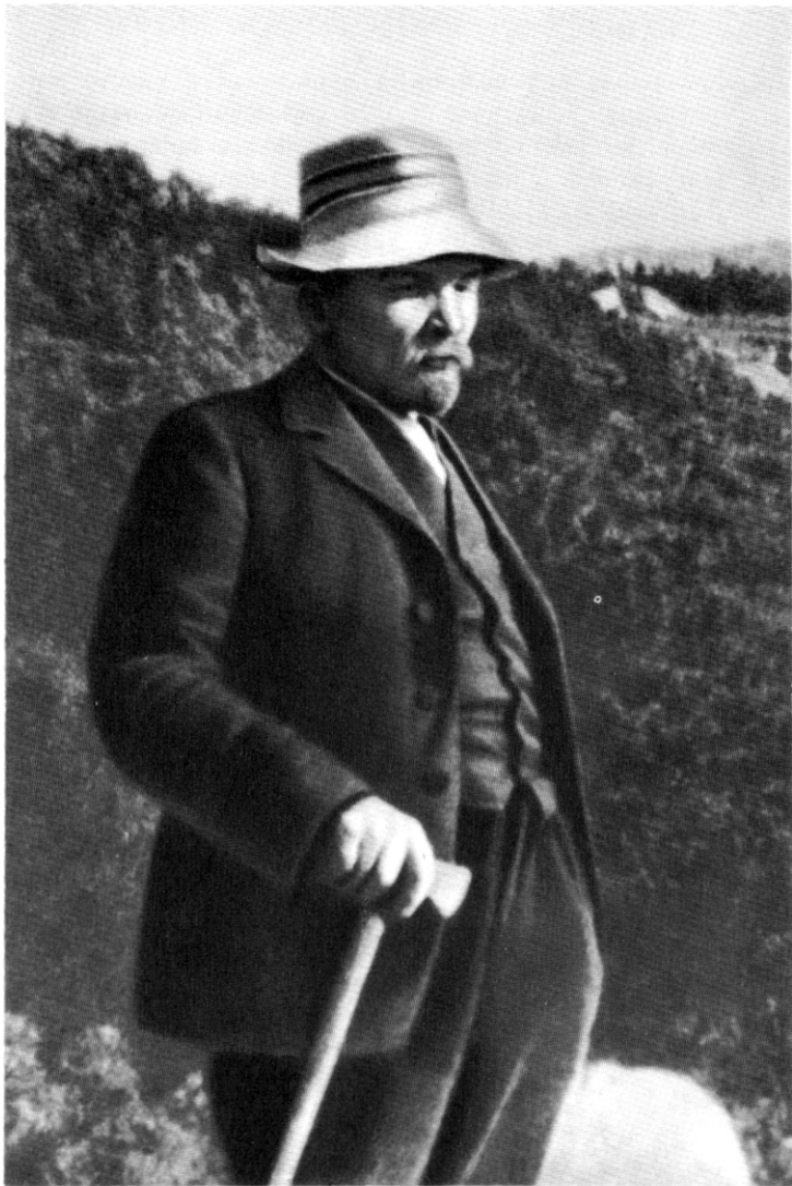
V. I. Lenin in Zakopane 1914