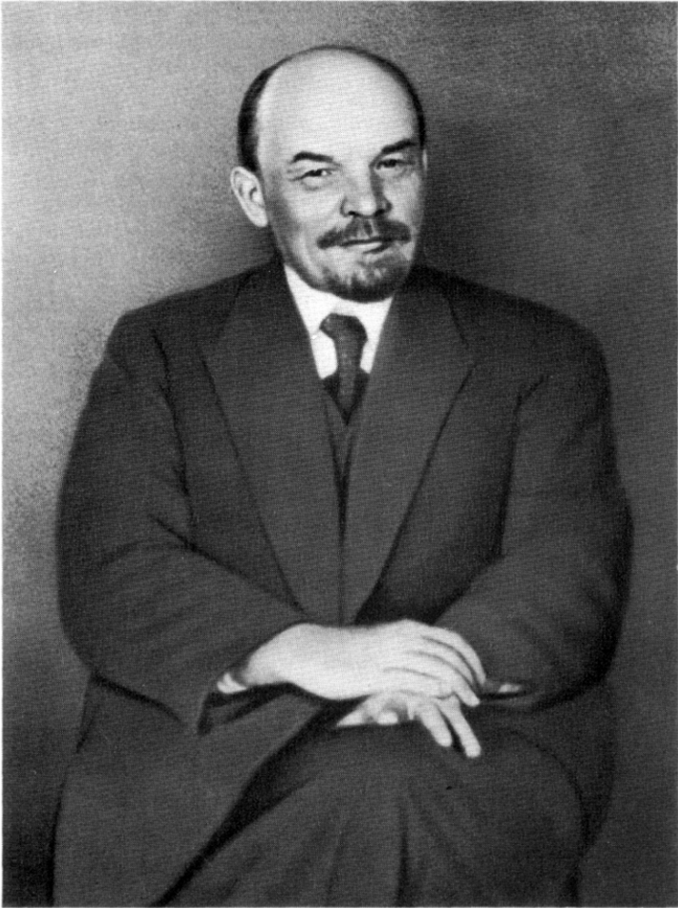
V. I. Lenin 1921