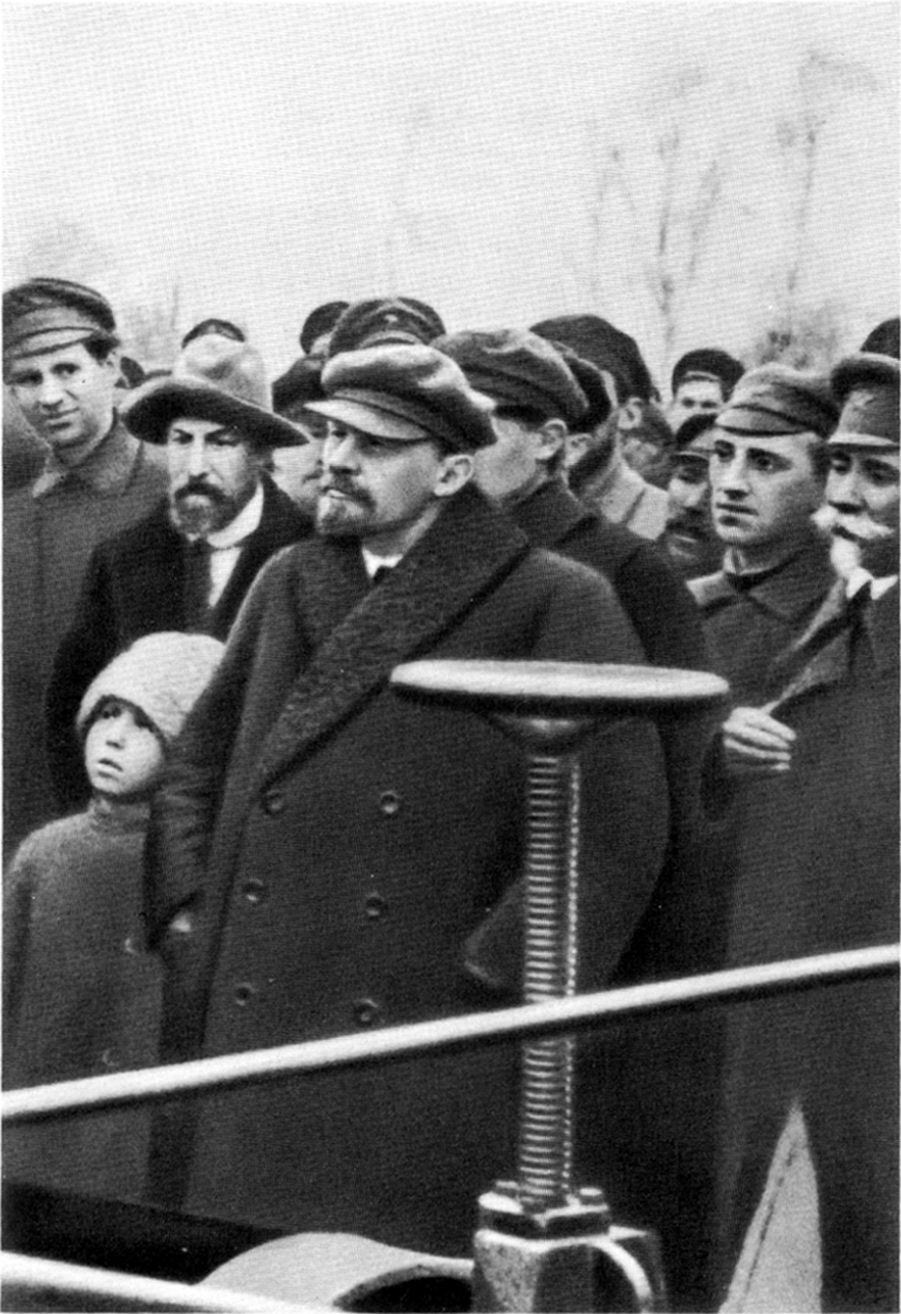
V. I. Lenin watches the trials of the first Soviet electric plough at the training and experimental farm of the Moscow Zootechnics Institute. October 22, 1921