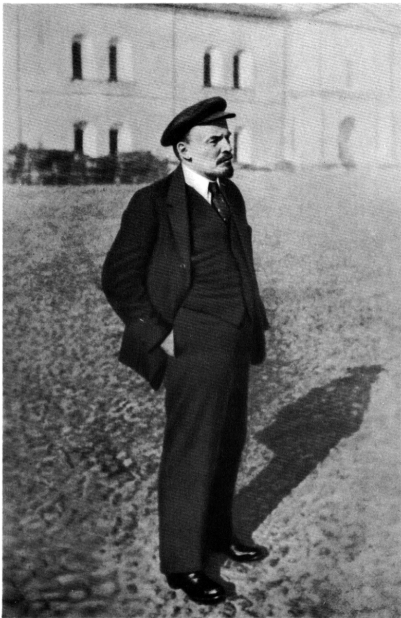
V. I. Lenin in the Kremlin courtyard during convalescence after the attempt on his life. October 1918